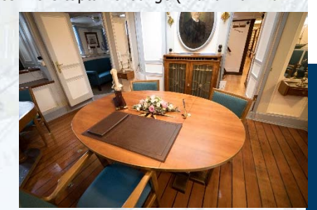
Wedding table in the captain's salon

Beforehand, the wedding party meets in the former ship's hospital, which has now become a museum. Appointments can be made via the registry office in Bremerhaven: Telephone: 0471 590 2365