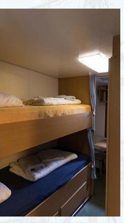
Double cabin on board